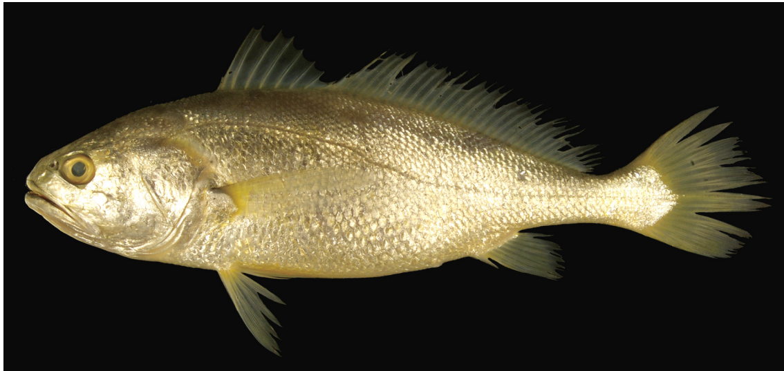
FIGURE 1. Larimichthys terengganui sp. nov. (paratype: KAUM-I. 16977, 200 mm SL; identified as Larimichthys crocea in Matsunuma et al. (2011: 140).

Dorsal fin with IX spines on the anterior (spinous) portion and I spine and 29–32 soft rays on the posterior portion. Anal fin with II spines and 8 or 9 soft rays. Pectoral fin with 16–17 soft rays. Outer gill rakers of 1 st arch 7–9 + 15–17 = 22–25. Inner gill rakers of 1 st arch 5–6 + 12–14 = 17–19. Preopercular margin weakly indented no sharp spines. Lateral line pore scales 49–54. Circumpeduncular scales 18–20. Vertebrae 11 + 13 = 24.