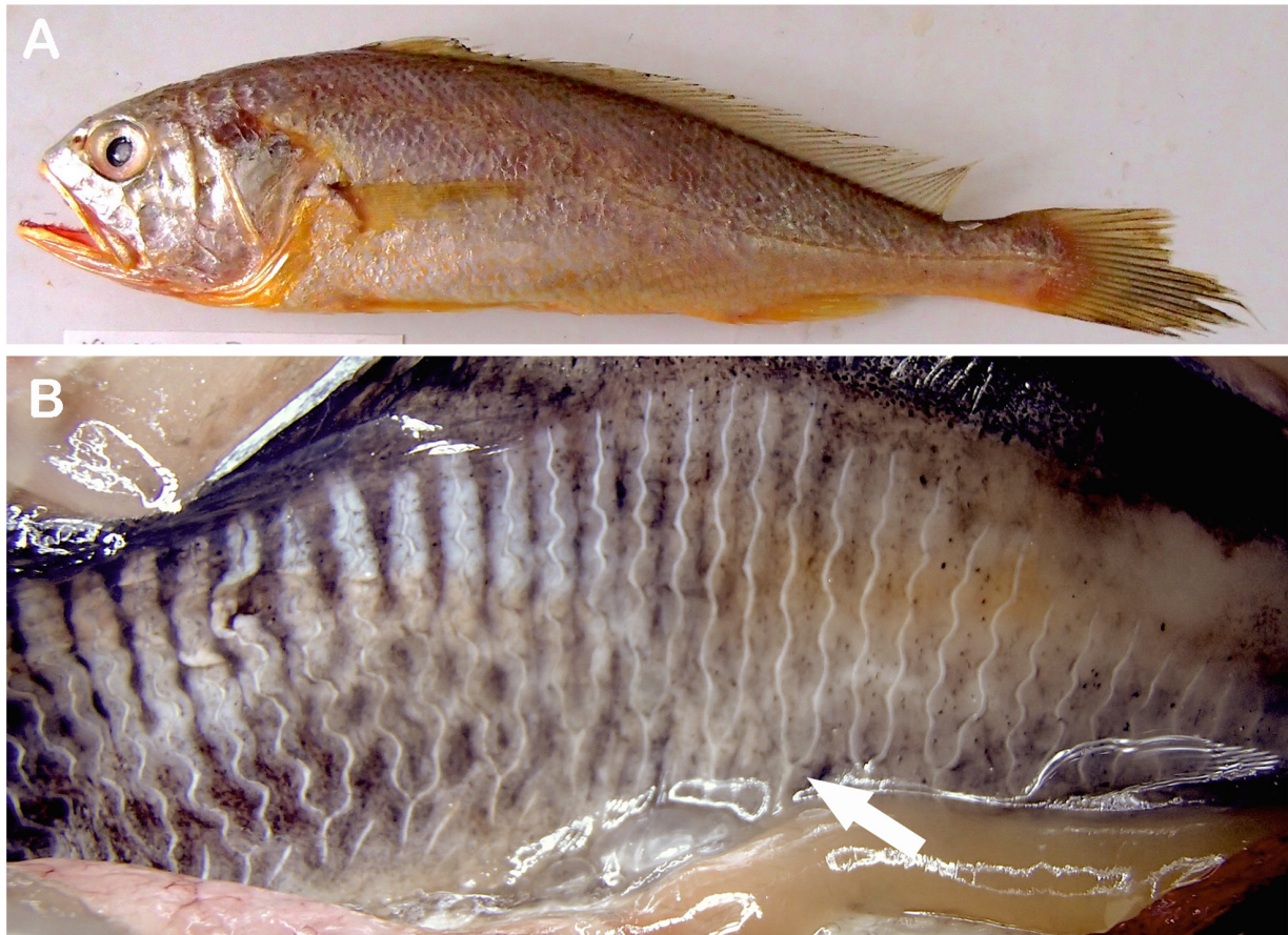
FIGURE 5. Larimichthys crocea (A) and gas bladder appendages of ventral limb with two elongated branches, indicate by arrow (B).