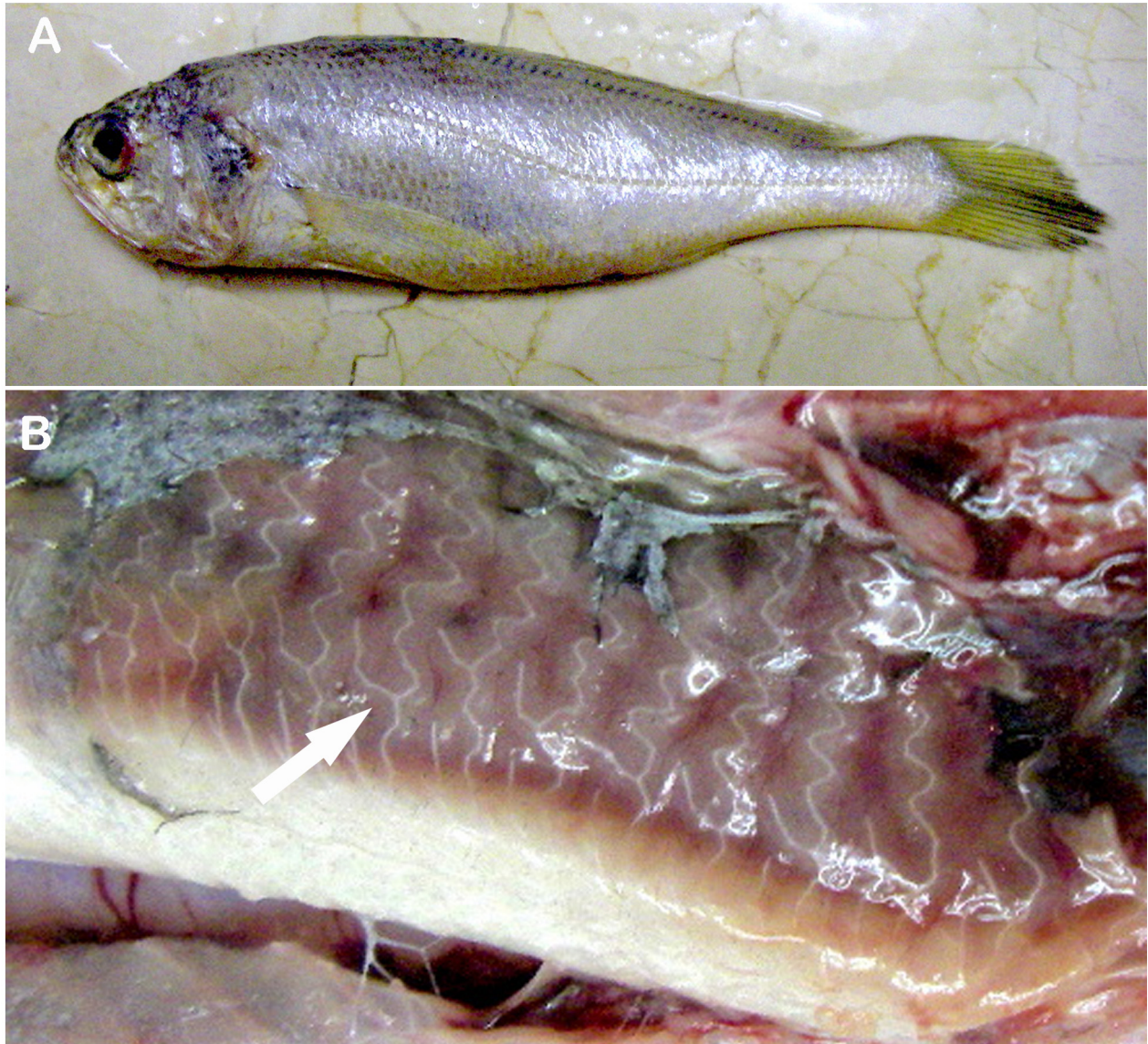
FIGURE 6. Larimichthys polyactis (A) and gas bladder appendages of ventral limbs with elongated anterior branch and a short posterior branch, indicate by arrow (B).

Remarks. The species was first reported in Matsunuma et al. (2011:140) as a new record of Larimichthys crocea in east coast of Peninsular Malaysia. Three specimens were kept at the UMT fish collection. In March 2014, Mr Norhafiz Hanafi collected additional specimens and which were subsequently identified as a new species described herein.