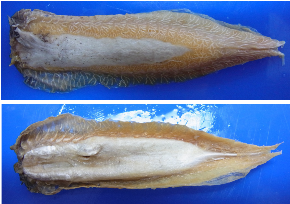
FIGURE 2. Gas Bladder of Larimichthys terengganui (paratype: NMMB-P 21723, 166 mm SL, female), with 26 pairs of lateral appendages and follow by a couple of long branched appendages extended to the base of anal fin. Dorsal view (top) and ventral view (bottom).

Mouth large oblique, terminal, maxillary 1.8–2.1 in head length, the lower jaw slightly projecting, the mouth gape forming an angle of about 45 degrees. Tip of upper lip on horizontal passing near ventral margin of orbit. End of maxillary on vertical line passes near posterior margin of eye. Underside of lower jaw with 6 pores, the median pair set on tip of lower jaw.