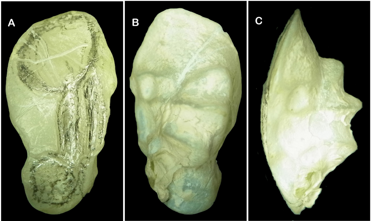
FIGURE 4. The right sagitta of Larimichthys terengganui , medial surface (A), lateral surface (B) and dorsal view (C), NMMB-P 21723, 166 mm SL, Female.