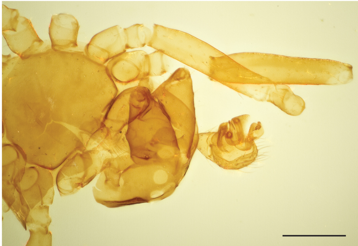
FIGURE 2. Holotype of Alaxchelicerca ordinaria Butler, 1932. Male habitus, ventral view (mounted on slide). Scale bar: 1 mm.