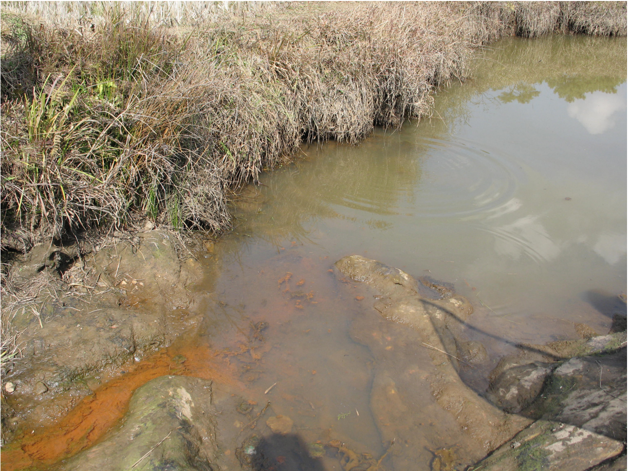
FIGURE 3. Seinphoh stream near Jowai, Jaintia Hills, Meghalaya, India, type locality of Dario kajal . The new species was collected from the clearer stretch of water on the left side of the pool.