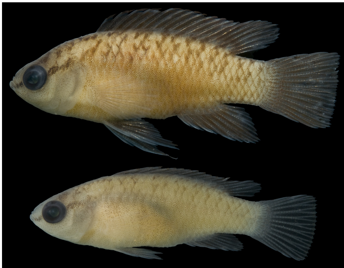
FIGURE 1. Dario kajal , new species, BMNH 2006.8.2.1, male, holotype, 17.8 mm, above; BMNH 2006.8.2.2-26, female, paratype, 15.4 mm SL, below: Seinphoh stream, Jaintia Hills, Meghalaya, India.

Coloration in life. Overall pattern of colour markings in specimens right after capture similar to preserved specimens (Fig. 2). Subdistal white rim of spinous dorsal fin bordered distally by black narrow band. Cheek, opercle and cleithrum with some iridescence.