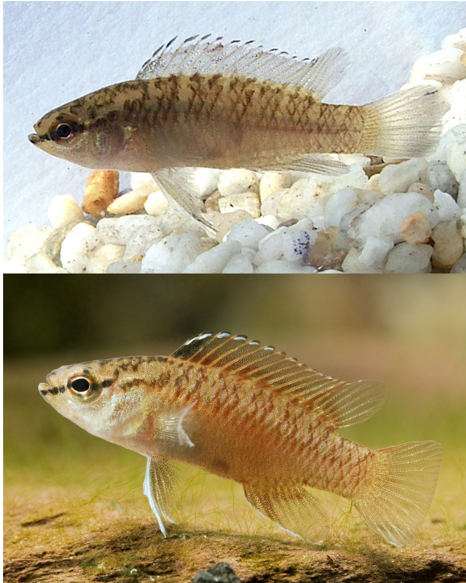
FIGURE 2. Dario kajal , coloration in life. Above, one of the types immediately after capture. Below, acclimatized specimen from aquarium import, reportedly from Meghalaya.

In acclimatized specimens subdistal band in dorsal fin, leading edge of pelvic fins, and distal rim of anal fin bright bluish white (Fig. 2). Pre- and postorbital stripes conspicuous. Double bar saddles orange brown, belly region a uniform lighter brown. Anteriormost two membranes of dorsal fin up to subdistal band with dense covering of melanophores. More posterior fin membranes of dorsal fin and those of caudal and anal fins with fewer melanophores and more orange-brown chromatophores.