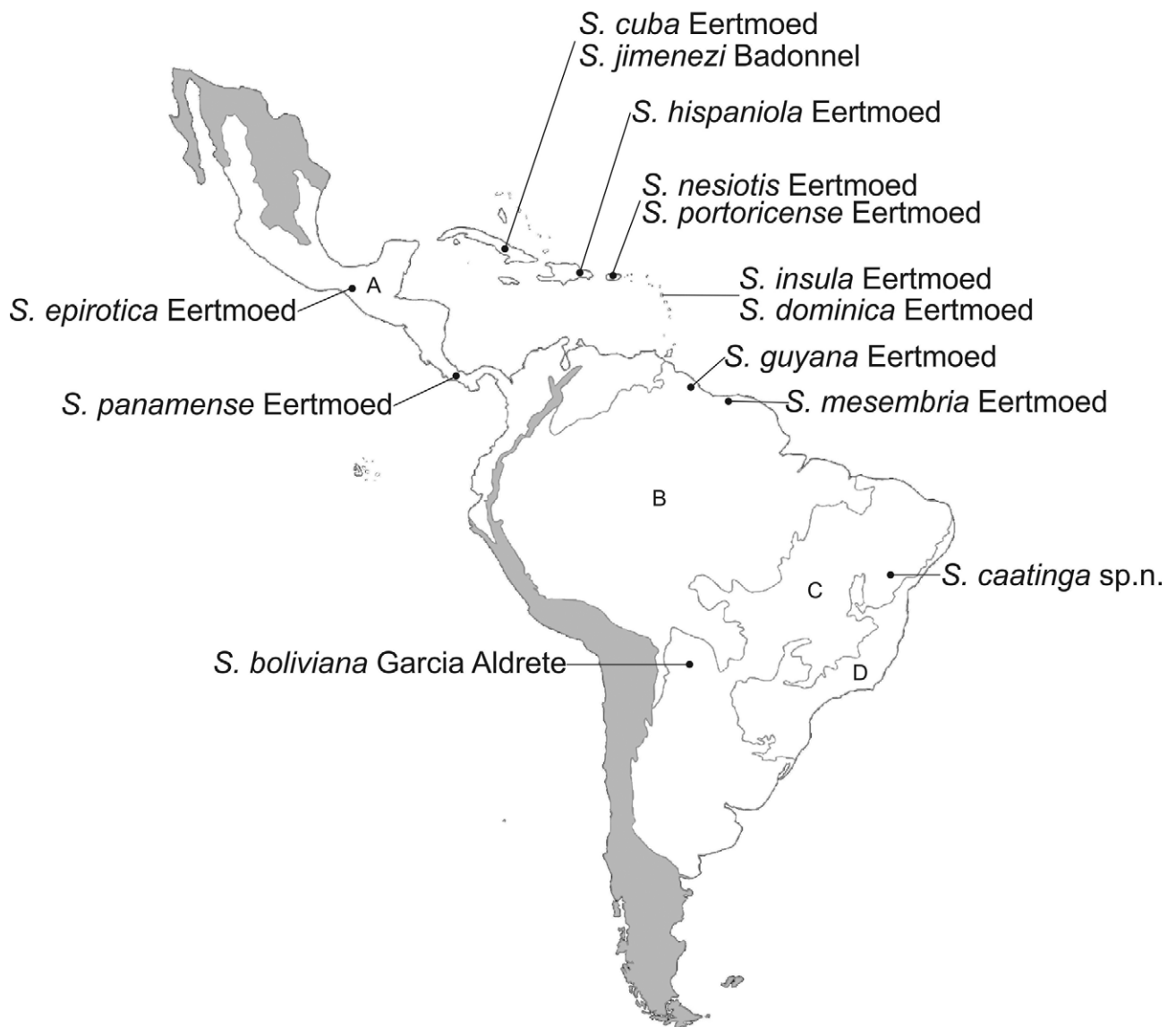
FIGURE 12. Distribution of the species of Spurostigma in four subregions of the Neotropical region. A. Caribbean. B. Amazonian. C. Chaco. D. Paranaense.