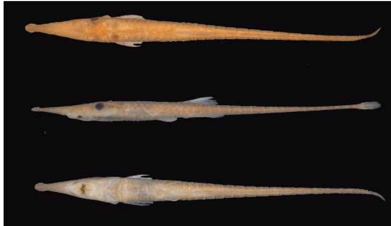
FIGURE 1. Acestridium colombiensis INHS 99093, paratype, 45.7 mm SL, dorsal, lateral, and ventral views.

Outer portion of the upper lip is lightly pigmented and the inner portion is unpigmented. The lower inner lip is unpigmented and the outer side has a few dark melanophores.