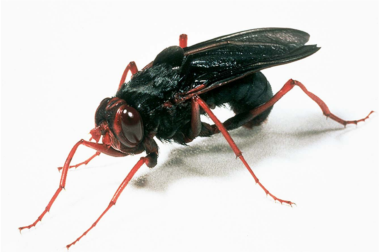
FIGURE 1. Adult Gyrostigma rhinocerontis Owen.

of the volume. However, biographers and bibliographers of Owen (Owen 1894; Sherborn 1894) give clear evidence that Owen is the author of this volume. Examining the contents shows there are a number of instances where Owen's name is indicated, initially as "R. Owen" and subsequently by his initials "R.O." appended to new names (see Table 1 below) as well as associated with an editorial footnote (p. 35). There are no initials for a few new names, including Oestrus rhinocerontis , which further compounds the question of authorship of those names in particular. However, the evidence that best supports Owen as author of the entire work was made by Townsend (1940) in the third supplement volume (overall volume VIII) to the catalogue of the library of the British Museum (Natural History). Townsend (1940: 1102) mentioned the authorship of Owen for the 1830 work in an annotation under the "Royal College of Surgeons" entry stating: "The author's initials appear at the end of a footnote on p. 35. On the recto of the fly-leaf to Owen's MS. dedication of 'This is his first work' to his Mother".