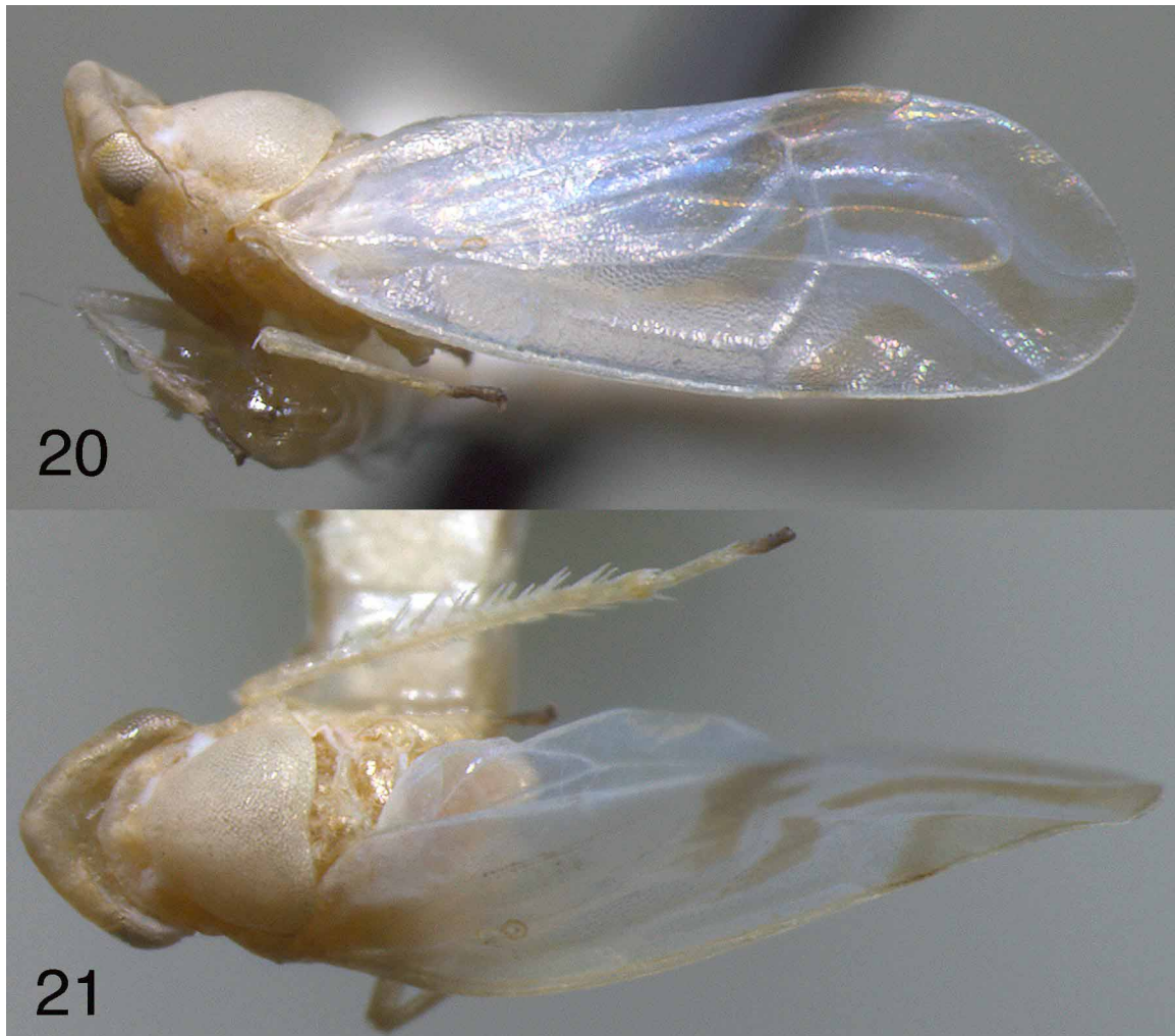
FIGURES 20–21. Sweta hallucinata , lateral and dorsal habitus, paratype female from Mizoram.

421m, Malaise trap 1–8.ix.2007, Bunruen Kwunnui & Acharaporn Sukpeng T2832 (QSBG); 1 ♂ THAILAND Lampang, Chae Son NP Huay Yen 18°49.924'N 99°28.652'E 419m, Malaise trap 1–7.xi.2007, Bunruen Kwunnui & Acharaporn Sukpeng T2837 (INHS); 1 ♀, INDIA: Mizoram: Aizawl, 18.xi.1981, C.S.W. Wesley (BMNH).