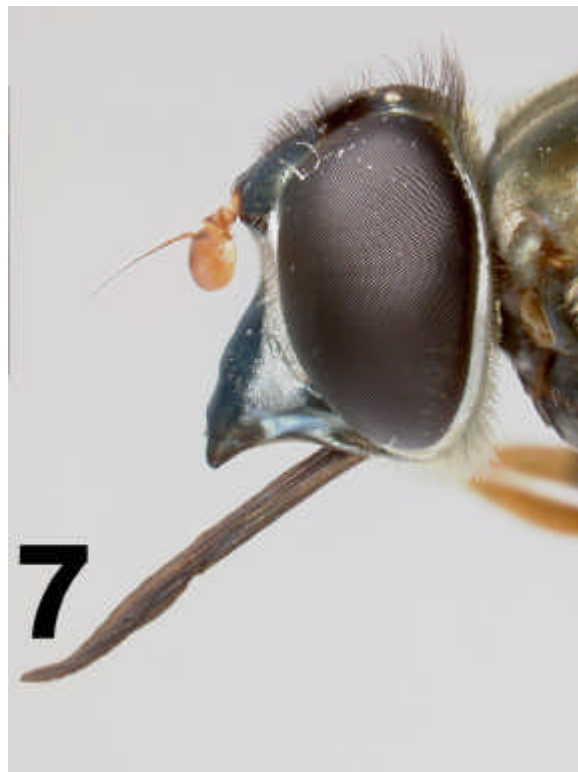
FIGURE 7. Head, lateral view, Austalis rhina , sp. nov.

Male.— Head (Fig. 7): metallic greenish black; face silvery-white pollinose and pilose laterally and ventrad antenna, shiny and bare medially and along oral margin, produced strongly anteriorly, with low indistinct tubercle; gena very narrow, silver-white pollinose and pilose; lunule orange; frons narrowly silvery-white pollinose laterally, shiny medially, black pilose; vertex dull brownish-black pollinose, black pilose; eyes broadly dichoptic, separated by 1/4 head width, bare; antenna orange except basoflagellomere brownish dorsally, black pilose on basal segments, basoflagellomere with large basoventral sensory pit on inner side; arista orange, bare; occiput silvery pilose and pollinose on ventral 2/3 , becoming sparsely pollinose on dorsal 1/3 with a row of black cilia.