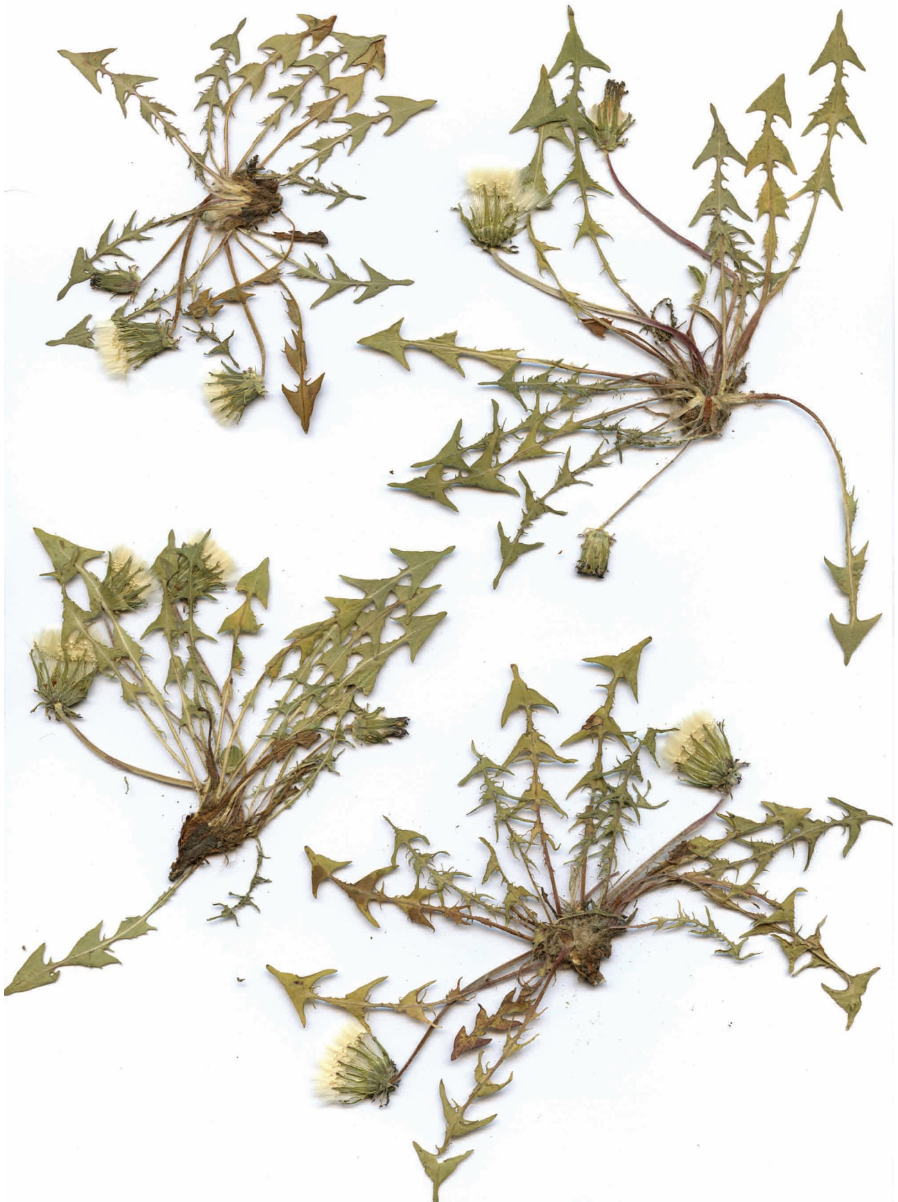
FIGURE 2. Isotypes of Taraxacum pudicum . Plants with well-developed inner leaves are shown.