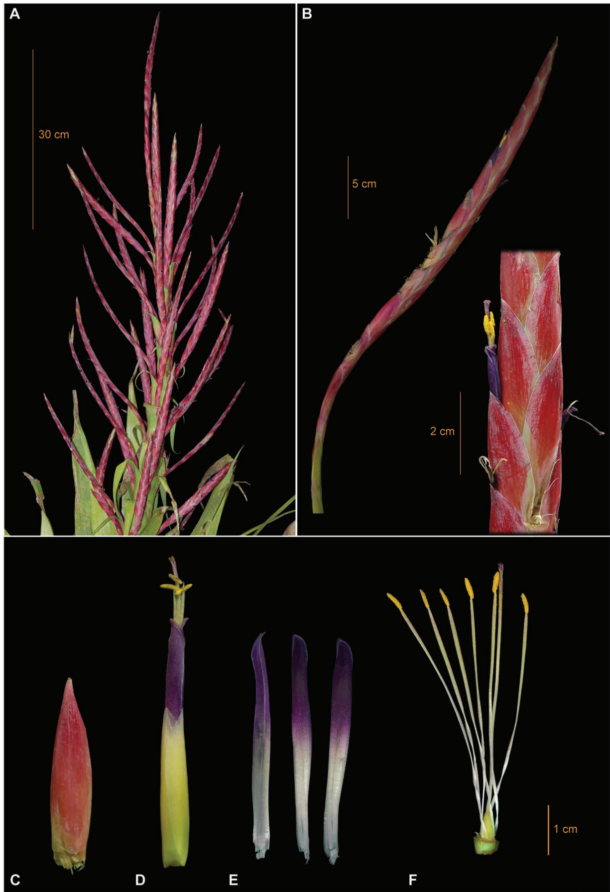
FIGURE 2. Tillandsia chalcatzingensis A. Inflorescence. B. Spike and detail with a flower. C. Floral bract. D. Flower. E. Petals. F. Androecium and gynoecium.