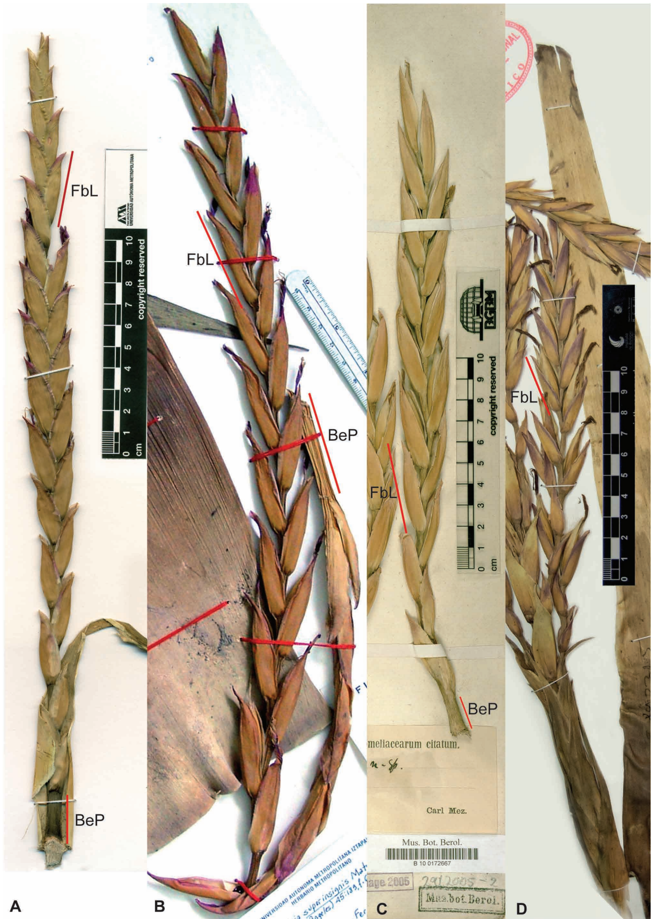
FIGURE 3. Spike details of A. Tillandsia chalcatzingensis . B. T. superinsignis . C. T. thysigera . D. T. tonalaensis . Abbreviations used: FbL. Floral bract length; BeP. basal ebracteate portion of pedicle.