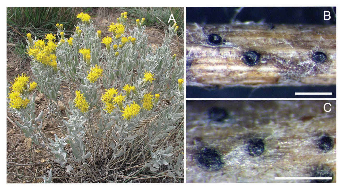
FIGURE 2. Muriphaeosphaeria galatellae (MFLU 15–0087, holotype ) A . Galatella villosa (L.) Rchb.f. summer. B . Superficial ascomata of sexual state (MFLUCC 14–0614). C . Conidiomata on host (MFLUCC 15–0769). Scale bars: B, C = 500 μm.

Saprobic on dead and dying stems. Sexual morph: Ascomata coriaceous, superficial, solitary, scattered, globose to cupulate, black to dark brown, smooth-walled, ostiolate. Ostiole central, lacking periphyses. Peridium multi-layered, dark to light brown, comprising cells of textura angularis, with inner hyaline layer. Hamathecium comprising long, filamentous, narrow, septate pseudoparaphyses surrounding asci. Asci 8-spored, bitunicate, fissitunicate, cylindrical to clavate, short-pedicellate, apically rounded with an ocular chamber clearly visible when immature. Ascospores biseriate, partially overlapping, obovoid to sub-fusiform, narrow towards ends, slightly curved, transversely septate, with a longitudinal septuma in the central cells, slightly constricted at the central septum, light brown to yellowish, granulate, solitary, scattered, ostiolate. Pycnidial wall thick-walled, multi-layered, with inner layer comprising several cell-layers, comprising brown-walled cells of textura angularis. Conidiophores reduced to conidiogenous cells. Conidiogenous cells holoblastic with percurrent annelidic proliferations, integrated, oblong, hyaline, brown when mature, smooth-walled, and formed from the inner layer of pycnidial wall. Conidia oblong to cylindrical, narrowly rounded at both ends, transversely septate, pale brown when mature.