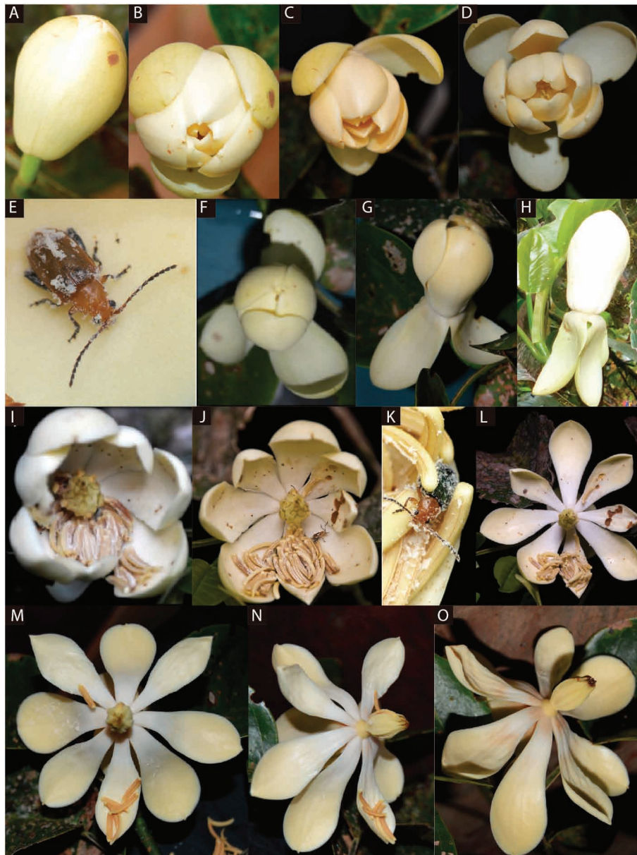
FIGURE 3. Magnolia vargasiana . Flowering timing. A. Day zero (0D, female phase), 16:49 hrs. B. 0D 17:16 hrs. C. 0D 17:28 hrs. D. 0D, 18:00–19:58 hrs. E. Flea beetle, orange brownish (Tribe Alticini, Chrysomelidae). F. 0D 21:04 hrs. G. Day one (1D, male phase) 4:23 hrs. H. 1D, ca. 9:13 hrs. I. 1D, 14.05 hrs J. 1D, 14:25 hrs. K. Flea beetle, bright green. L. 1D, 14:55 hrs. M. 1D, 18:27 hrs. N. 1D, 18:27 hrs. (side view). O. 2D, 2:43–6.19 hrs. (Photographs: A–D, F–G, & M–O by Antonio Vázquez, from Vázquez-García et al. 10131; E & I–K by Lou Jost, based on Merino s.n. , ECUAMZ, IBUG; and H by Efrén Merino, based on Merino-Santi s.n. , ECUAMZ, IBUG).

Distribution and ecology: — Magnolia vargasiana is endemic to the Cordillera de los Llanganates, Tungurahua (Ecuador) and is thus far only known from the type locality, consisting of two trees > 10 cm dbh within a permanent forest inventory plot of 0.25 ha at 2000 m elevation in the Río Zuñac Reserve (Zuñac Plot 2). The Río Zuñac Reserve is a privately held conservation area privately owned by an Ecuadorian non-government organization, the EcoMinga Foundation. The plot itself is about 1 km outside the boundary of Llanganates National Park, located on a steep mountain ridge above the canyon of the upper Río Zuñac; this portion of the Llanganates is also known as the Cordillera Abitagua. The climate is perhumid with annual rainfall greater than 4000 mm (Ministerio del Ambiente, 2012). Vegetation is described as being a dense cloud forest, with about 800 trees \geq 10 cm DBH per hectare and a closed canopy about 25 m tall with abundant vascular epiphytes and bryophytes. In the classification system of terrestrial ecosystems of Ecuador (Ministerio del Ambiente, 2012) the vegetation type at the site is “bosque siempreverde montano del Norte de la Cordillera Oriental de los Andes”. The dominant tree species recorded in the 0.25 hectare include Wettinia fascicularis (Arecaceae), Brunellia pallida (Brunelliaceae), Weinmannia pinnata (Cunoniaceae), Dicksonia