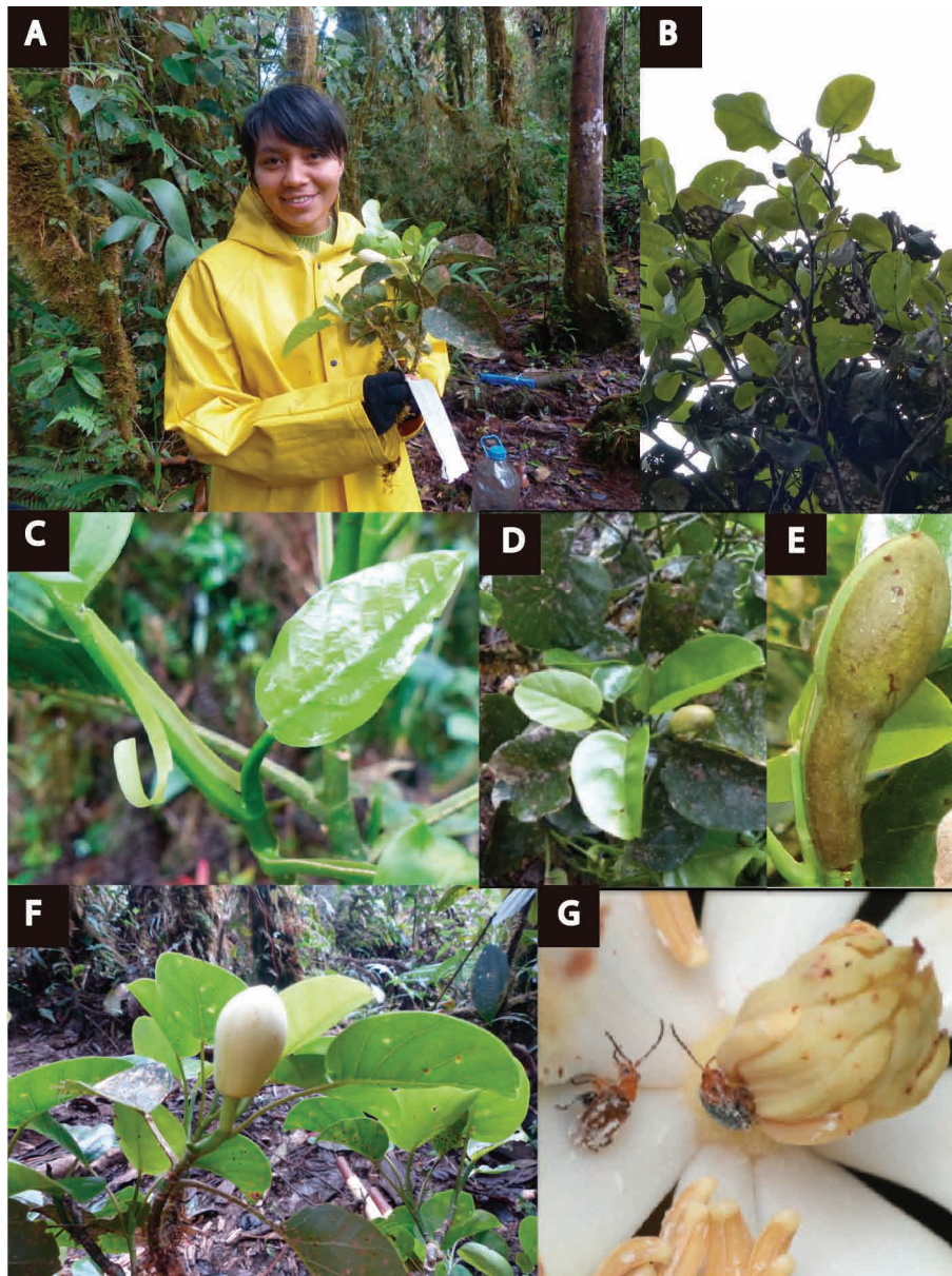
FIGURE 2. Magnolia vargasiana A. Yajaira Malucín, student at Universidad Estatal Amazónica, holding a flower bud, with sepals all the way down in day one (male phase) at 9:16 hrs, where flea beetles had just overnighted and are about to leave the flower in the afternoon. With dense “bosque siempreverde montano” in the background. B. Foliage. C. Detaching stipule. D. Branch with flower bud including second hypsophyll. E. First hypsophyll. F. Flower bud in day 0 (0D, female phase), without hypsophylls. G. Flea beetles (Tribe Alticini, Chrysomelidae) covered with pollen.

Trees 11–26 m tall, 20–50 cm dbh, first branches at 6–10 m; bark longitudinally and narrowly striate with lenticels, apparently smooth, greyish; terminal twig internodes 4.0–8.0(–10.0) × 2.8–4.0 mm, lenticellate, glabrous; petioles 4.0–6.50 × 0.2–0.3 cm, stipules c. 3.4 cm long, covering the entire length of petiole; mature leaf blades 6.0–10.5 × 7.5–11.0, suborbicular, broader in the lower half, rarely wider than long, subcordate to cordate at the base, obtuse or rarely emarginate at the apex, coriaceous, glabrous, 6–7 lateral veins per side; hypsophylls (2.0–)3.5–2.8 × 2.5–3 cm, peduncle 1.0–1.8 cm, flower buds ellipsoidal 1.5–2.8 × 1.5–1.7 cm, glabrous; open flower 7.0–7.5 cm in diameter; sepals elliptic 3.6–3.7 × 1.8–2.0 cm, adaxially creamy white, abaxially dark grayish at the base and axis, fading to creamy white at the margins; petals 8, obovate to spatulate and concave, unequal in size, 2.7–3.8 × 0.8–2.0 cm, creamy white; stamens 50–54, 1.20 × 0.15 cm, creamy white; gynoecium ellipsoid, 1.5–1.7 × 0.7–0.8 cm, pale yellowish green; carpels 10, styler tips 1.5 mm long, black. Fruit and seeds unknown.