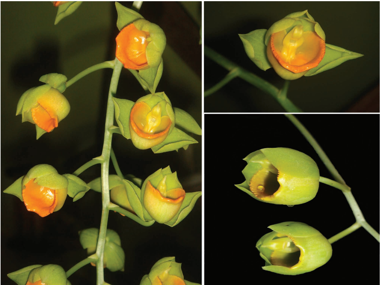
FIGURE 2. Male flowers from three specimens of the Catasetum telespirense Benelli & Soares-Lopes showing different colours and lip forms.

C. telespirense is similar to C. mattosianum Bicalho (1973:22), however it differs in the arched, semi-pendent inflorescence with the flowers distributed in the whole flower stem, resupinated lip, and color predominantly yellow (in C. mattosianum inflorescence is erect with non-resupinated flowers grouped only in the terminal portion of the stem).