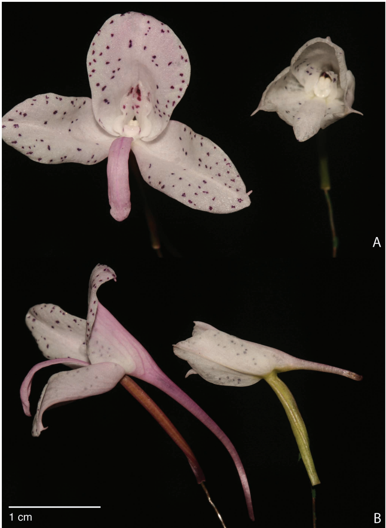
FIGURE 3. Close-up comparison of single flowers of the speckled light pink form of Disa amoena (left) and D. staerkeriana (right). A. Front view. B. Side view.