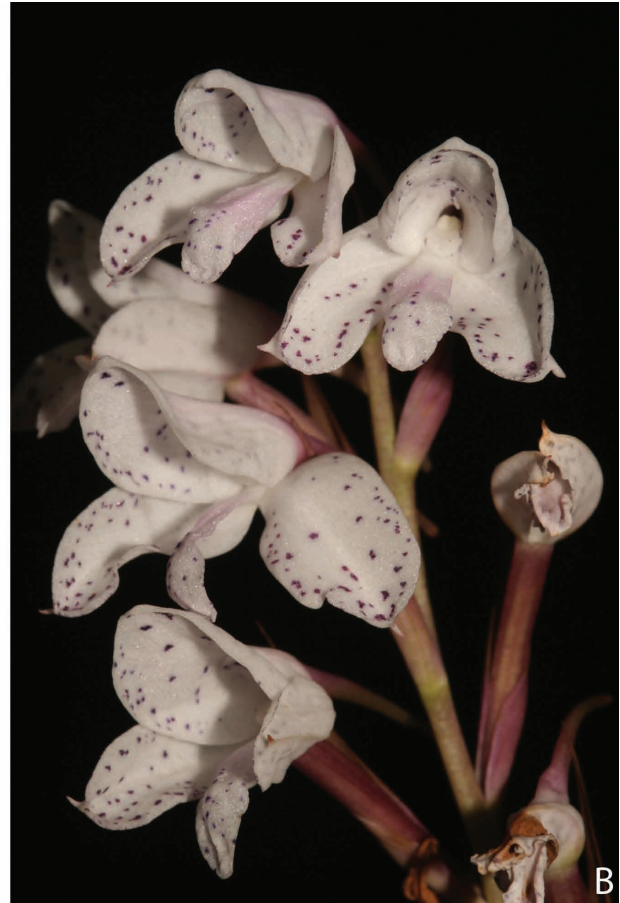
FIGURE 1. Disa staerkeriana . A. Plant in grassland habitat. B. Close up of inflorescence.

Distribution and altitudinal range: —Currently known from a single population in which 30 individuals were counted, covering an area of \pm 500 \times 700 m in size between 2160–2231 m elevation.