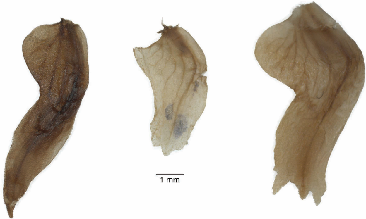
FIGURE 4. Close-up comparison of the petal of Disa montana (left), Disa staerkeriana (middle) and Disa amoena (right).