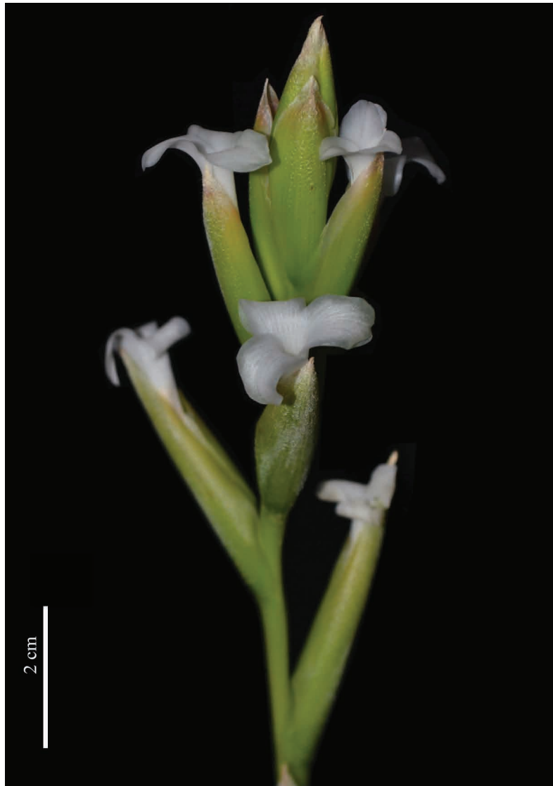
FIGURE 3. Tillandsia leucopetala (H. Büneker et al. 249). Detail of the inflorescence.

Tillandsia leucopetala has some morphological affinity with Tillandsia nuptialis Braga & Sucre (1969: 1), an endemic species from Rio de Janeiro, Brazil. However, it can be distinguished by its shorter stem, longer leaf blades (12–30 cm vs. 9–11 cm long), usually longer peduncle (up to 30 cm vs. up to 14 cm), longer inflorescence (up to 11 cm vs. up to 7 cm) with more flowers (to 11-flowered vs. ca. 6-flowered), floral bracts densely lepidote throughout the abaxial surface ( vs. lepidote at the apex only), longer petals (up to 4 cm vs. up to 3 cm) and longer sepals (up to 2.6 cm vs. up to 2.1 cm).