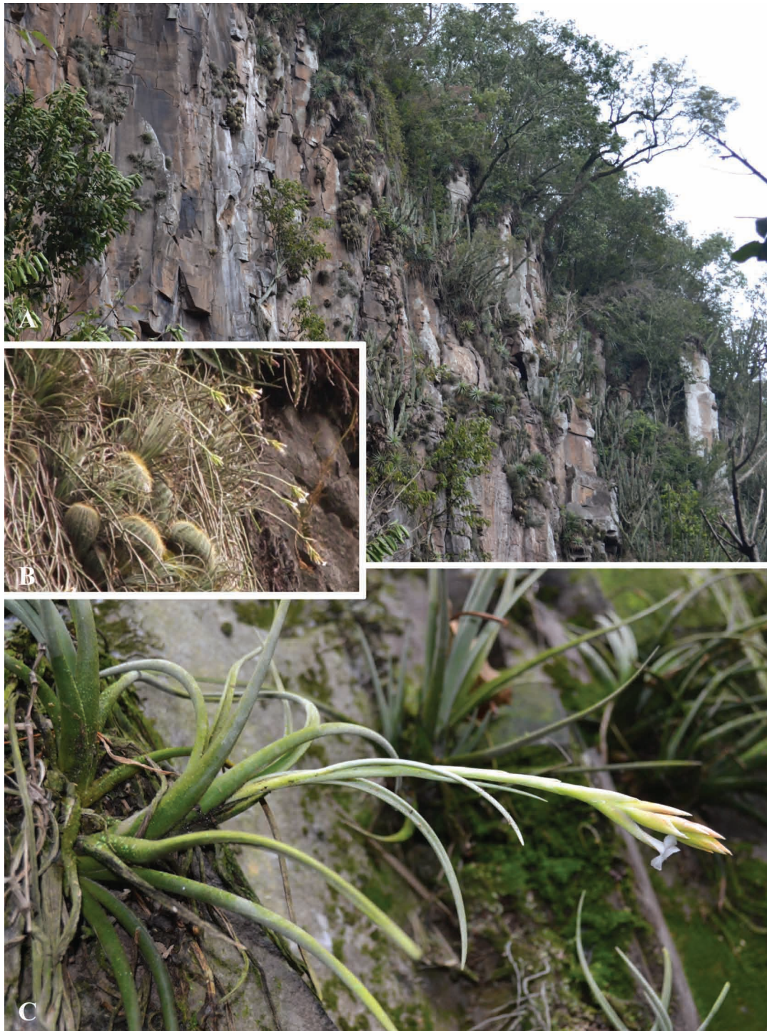
FIGURE 2. A–C. Tillandsia leucopetala (H. Büneker et al. 249). A. General view of the type locality. B. Population at the type locality in flowering, together with Eriocactus claviceps . C. Habit.

The new species is morphological closely related to T. toropiensis , which is endemic of the central region of the state of Rio Grande do Sul, growing saxicolous associated to the Cactaceae with Eriocactus magnificus Ritter (1966a: 50), on steep rocks along the Toropi River (Rauh 1984). Tillandsia leucopetala differs from T. toropiensis by its larger size (flowering up to 45 cm long vs. up to 30 cm long), longer leaf blades (12–30 cm vs. 8–20 cm), longer peduncle (12–30 cm vs. 8–19 cm), longer inflorescence (4.3–11 cm vs. 2.5–5.5 cm), with comparatively more flowers (4–11 vs. 3–7), as well as longer sepals (1.8–2.6 cm vs. 1.7–2 cm) and longer petals (up to 4 cm vs. up to 3.4 cm). Tillandsia leucopetala also differs by the color of the usually yellowish-green peduncle bracts and floral bract (vs. reddish), and by the lepidote sepals (vs. glabrous), having the adaxial ones connate up to the middle portion (vs. almost completely connate).