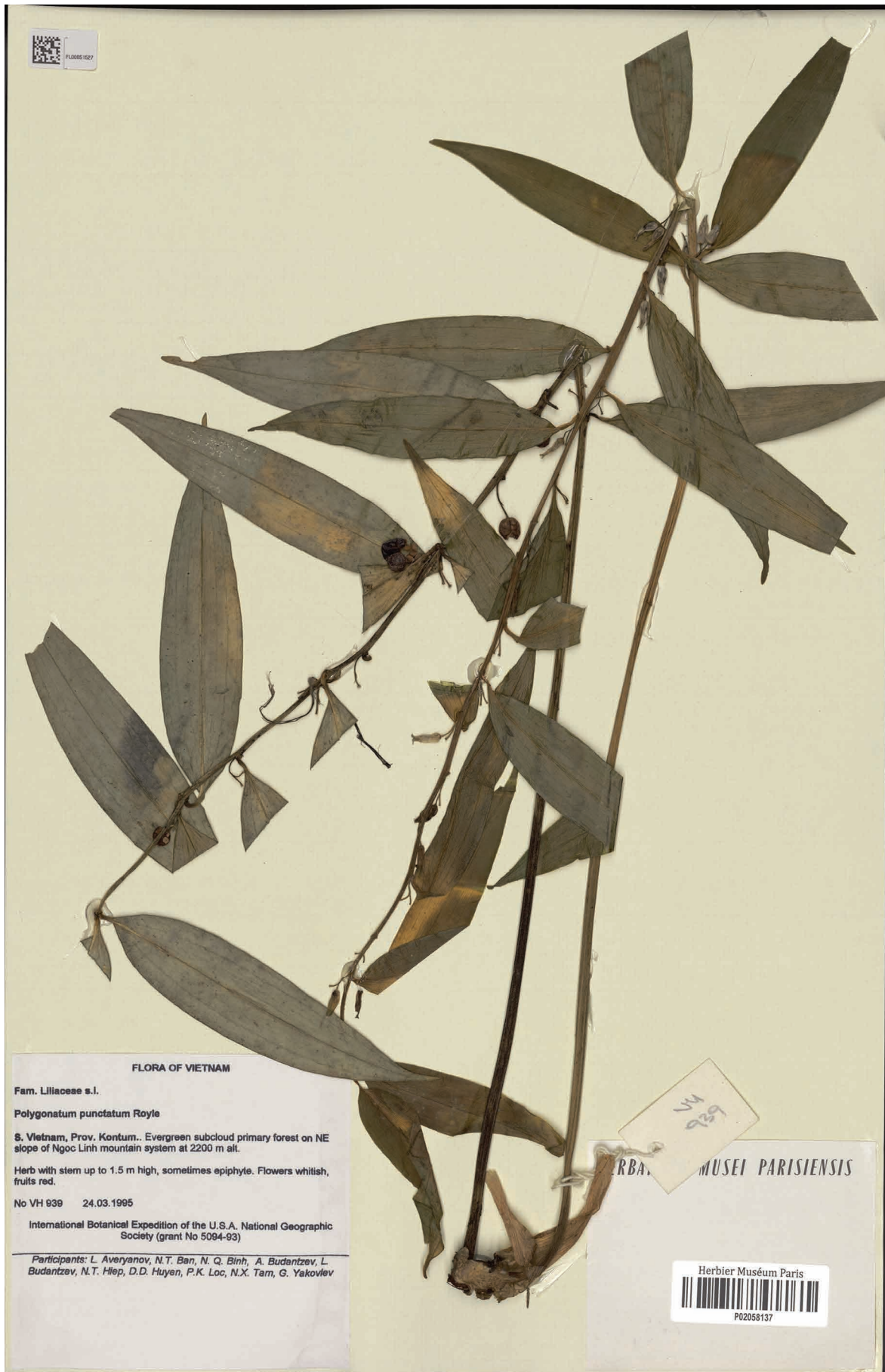
FIGURE 2. Polygonatum annamense , holotype at Paris (P), both in flower and the previous seasons stem in fruit, VH 939.