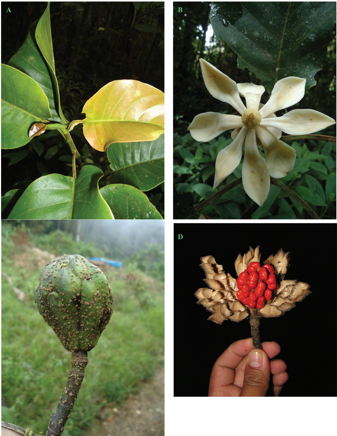
FIGURE 2. Magnolia sanchez-vegae , A. Detail of leaf base, B. Flower at anthesis. C. Obovate fruit with abundant lenticels. D. Aril

adaxial scar, (11.0–)5.7–4.0 cm long, 4 mm in diameter, glabrous, except for the apex, sometimes with hirsute hairs. Flowers terminal, solitary, floral buds oblong to obovate, 3.8–4.0 × 2.0–2.5 cm, hypsophylls 2–4, glabrous, peduncle 3.8–4.7 cm long, 6–8 mm in diameter, with sparse dark brown indumentum; sepals 3, 5.0–5.2 × 2.4–3.2 cm, navicular,