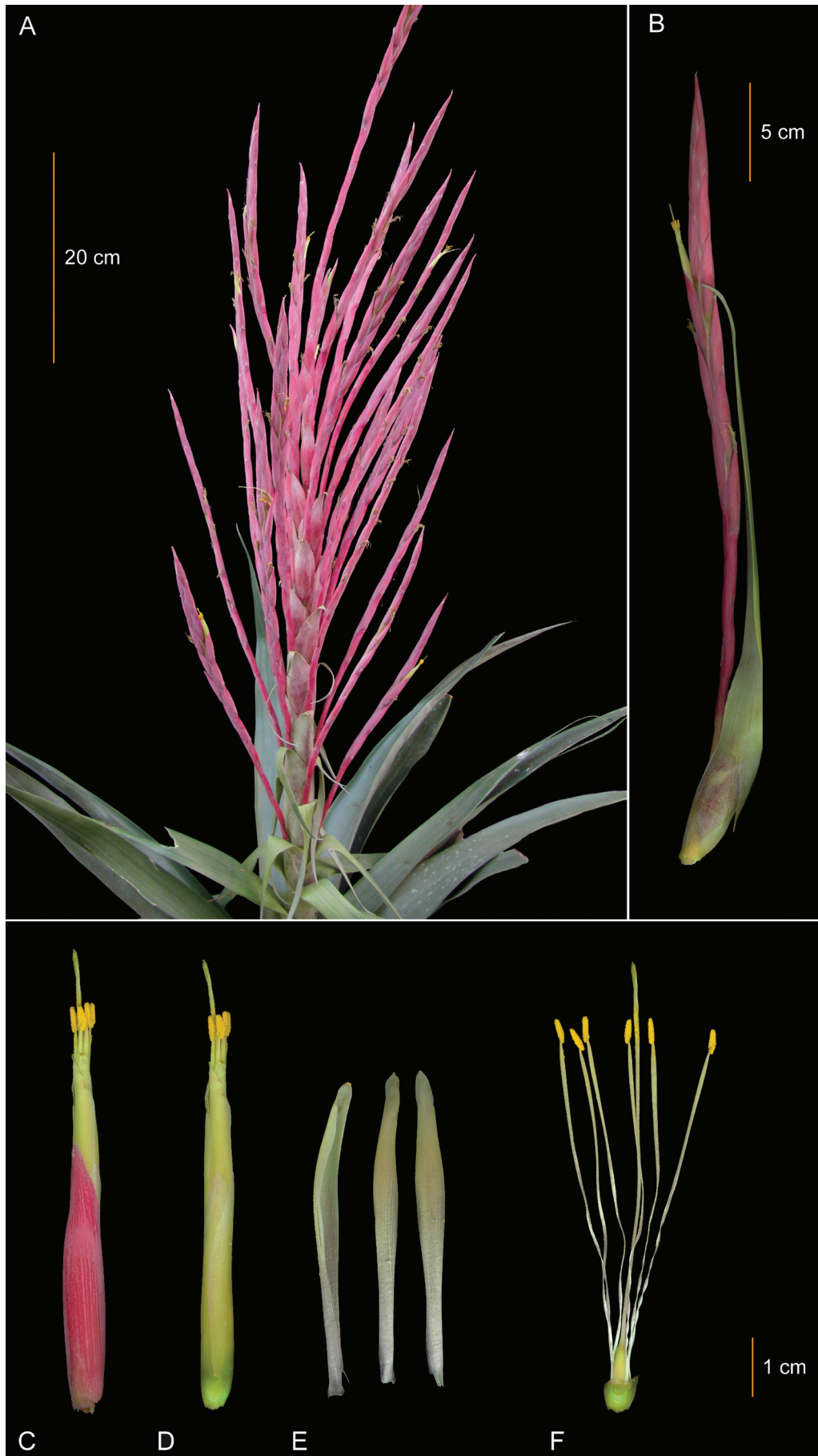
FIGURE 1. Tillandsia religiosa A. Inflorescence. B. Spike with primary bract. C. Flower with floral bract. D. Flower. E. Petals dissected. F. Androecium and gynoecium.