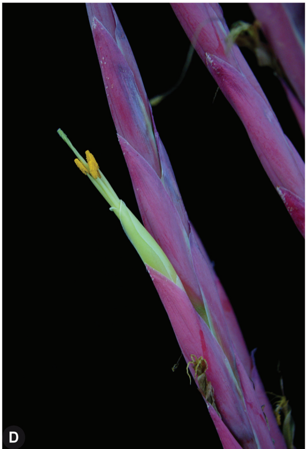
FIGURE 2. A–B, D. Tillandsia religiosa A. Habit (type collection). B. Plants used as ornaments in “nacimiento” at Tlayacapan. D. Detail of a spike with a flower. C. Tillandsia taxcoensis , detail of some spikes with flowers.