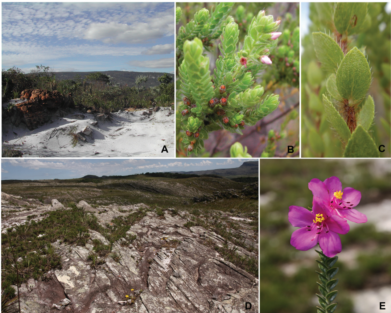
FIGURE 2. A–C Microlicia maximowicziana . A. Habitat in Grão Mogol. B. Flowering branch. C. Vegetative branch, showing horizontal to ascending leaves. D–E Microlicia riedeliana . D. Santana de Pirapama. E. Branch with 5- and 6-merous flowers. (Photos: P.O. Rosa A–B, A.F.A. Versiane C & W. Milliken D–E).

Discussion: —Digital images of collections L. Riedel 1211 , 1488 , and 1688 from BR are available from JSTOR (2014). An illustration (Fig. 1 A–M) is presented here to show the remarkable characteristics of M. maximowicziana and its relatives (Fig. 1 N–Q), as well as a photograph of a population in campo rupestre vegetation from Grão Mogol, with details of habitat, branches and leaves (Fig. 2 A–C).