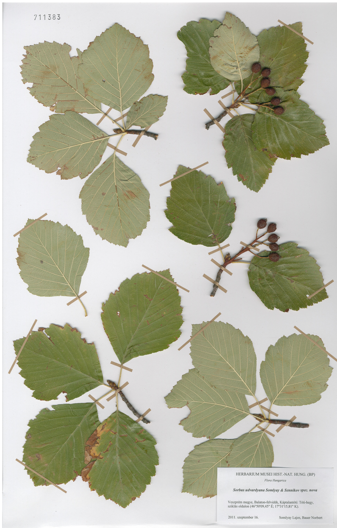
FIGURE 3. Isotype of Sorbus udvardyana , showing the leaves on sterile shoots.