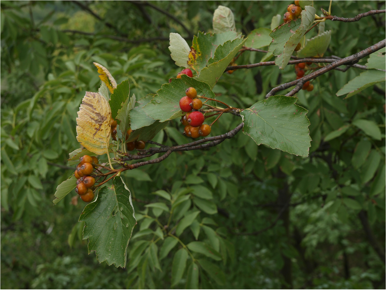
FIGURE 1. Photograph of fruiting branch from the type tree of Sorbus udvardyana .—Tóti-hegy, 16 September 2011.—Photo by N. Bauer.

(basally up to c. 1/6 width of half-lamina); veins 9–11 on each side; prominent lobes 3–5 on each side, apex \pm blunt to acute or acuminate, margins convex to conspicuously convex and obscurely serrate; approximate length of the upper side of the greatest lobe 4–7 mm long; leaf blades on short sterile shoots rhombic or elliptic or ovate, cuneate or broadly cuneate at base. Inflorescence compact, corymbose, branchlets tomentose. Flowers 10–14 mm in diam.; hypanthium turbinate; sepals triangular, densely tomentose on both surfaces, apex acuminate; petals white, elliptic to broadly elliptic, 4.5–6 \times 3.5–4.5 mm; stamens c. 20; filaments whitish; anthers yellow; styles 2. Fruits subglobose or globose, 10–13 mm in diam., sanguineous when fully ripe (without a tint of orange or brown colour), with numerous small lenticels. Seeds not observed. Flowering in May.