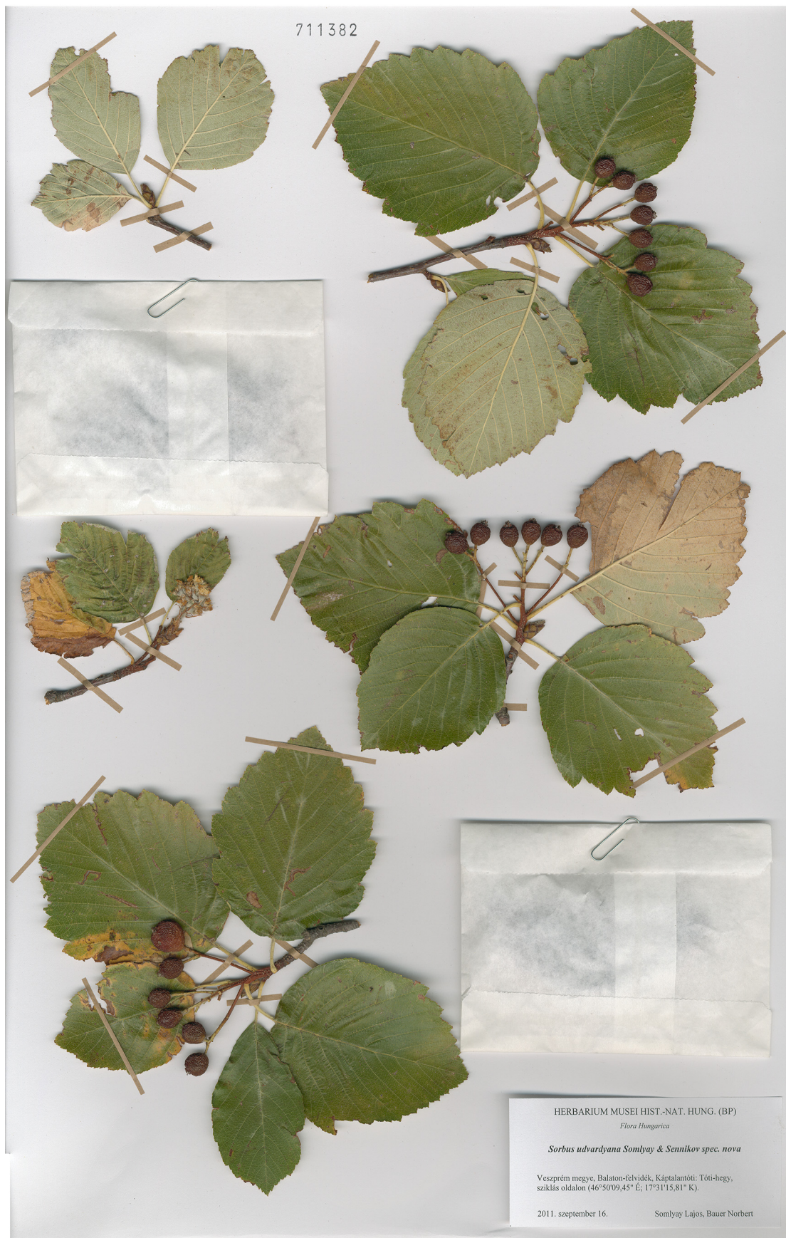
FIGURE 2. Holotype of Sorbus udvardyana , showing the leaves on fertile shoots.