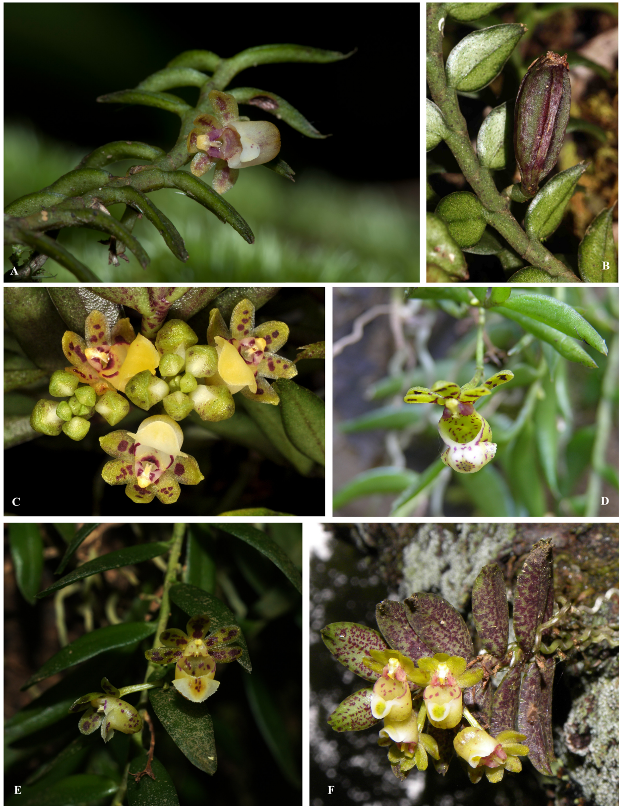
FIGURE 3. A. Gastrochilus kadooriei. B. Fruit of Gastrochilus kadooriei. C. Gastrochilus pseudodistichus. D. Gastrochilus distichus. E. Gastrochilus formosanus. F. Gastrochilus fuscopunctatus.