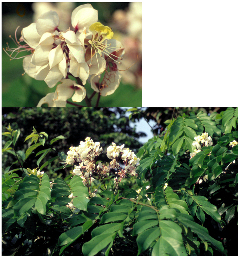
FIGURE 1. Flowering branch of Gabonius ngouniensis with close up of inflorescence (upper) to show petal development, shape and colour in an opened flower.