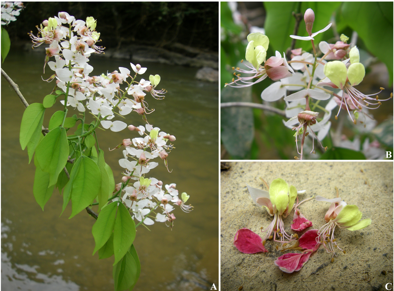
FIGURE 3. Annea laxiflora A: Flowering branch; B: Close up of flower; C: Fallen flower to show post-mature petal colour change. A–C. M'Boungou 398 .

Seeds 1–2, dark brown, ovoid, compressed, 15–20 × 14–17 × 4–5 mm (from Wagemans 2214 ). Seedling: first and subsequent leaves alternate, stipules not seen, leaflets sessile, 2-jugate, upper pair 58–66 × 26–35 mm, lower pair 26–32 × 15–22 mm (measurements from Donis 1860 & Wagemans 765 ).