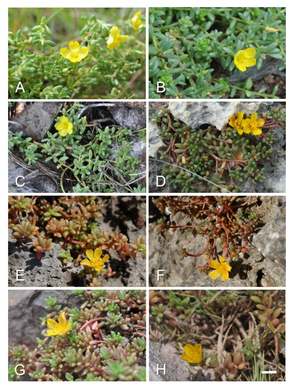
FIGURE 3. Flowering plants of Portulaca okinawensis from the Ryukyus. A. Amami Island (AM1). B. Amami Island (AM3). C. Tokuno-shima Island. D. Okinawa Island (OK1). E. Okinawa Island (OK2). F. Okinawa Island (OK4). G. Tonaki Island (TK). H. Aka Island (AK). Scale bar in H also applies to A–G, and indicates 5 mm (see the Table 1 for the localities abbreviations).