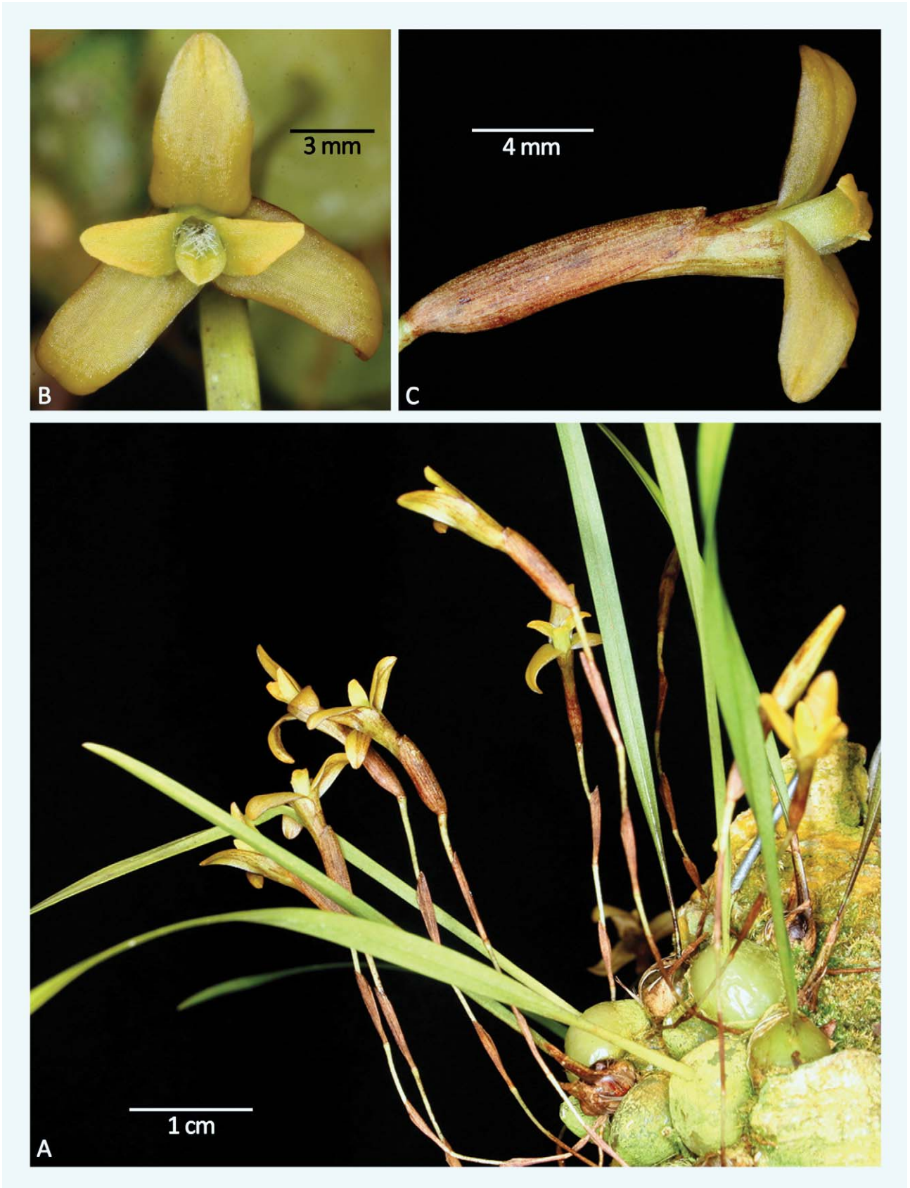
FIGURE 2. Cryptocentrum beckendorfii . A. Habit with inflorescences. B. Flower, front view. C. Flower, lateral view.