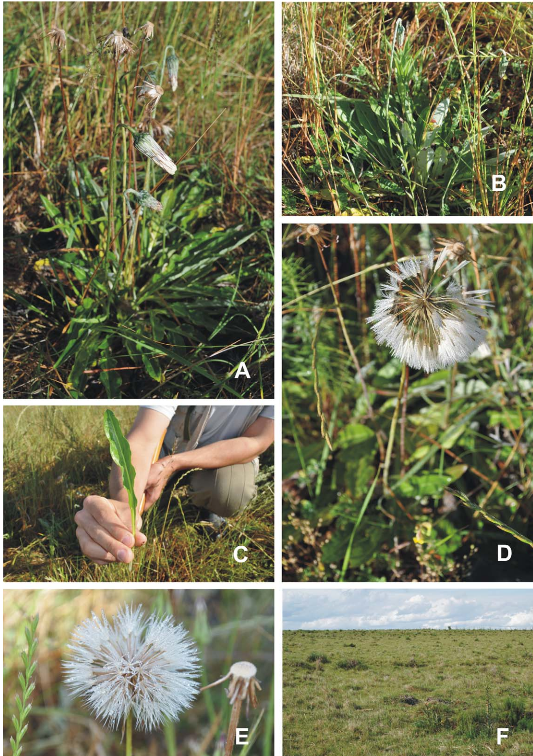
FIGURE 2. Chaptalia ignota . A, B. Habit. C. Detail of crenate-dentate leaf. D, E. Detail of scape and pappus. F. Grassland habitat at site, municipality of Aceguá, Rio Grande do Sul State, Brazil.

Florets trimorphic; outer florets pistillate, uniseriate, ca. 18, corollas ligulate–bilabiate, abaxial lip liguliform, white to pink, 4–6.6 mm long, apex irregularly 3-lobed; adaxial lip irregularly bifid, occasionally absent, tube 4.5–8.3 mm long; style 8.4–10.3 mm long, style lobes 1–1.6 mm long; middle florets pistillate, ca. 40, corollas filiform, tube 4.5–5.7 mm long; style 7.5–8.3 mm long, exserted, style lobes 1.3–1.6 mm long; inner florets