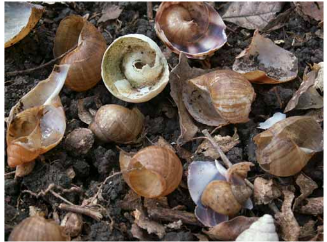
FIGURE 3. Rodent-damaged Placostylus shells are easily identified by the broad spiral band of shell removed from one or more whorls.

In New Zealand, predation by introduced pigs, rodents, and birds has also been implicated in the decline of the Placostylus species there, along with habitat destruction and modification by farming and burning (Penniket 1981; Parish et al. 1995; Sherley et al. 1998).