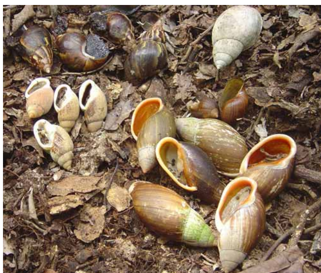
FIGURE 2. Morphological differences between the New Caledonian endemic snails Placostylus fibratus (bottom) and Placostylus porphyrostomus (middle), and the introduced snail Achatina fulica (top).

Placostylus fibratus reaches maturity at five years and, based on a prediction of shell growth rates, it is suggested that they may live 15 years and attain 11.7 cm shell height (Pöllabauer 1995). Once maturity is reached, the increase in shell height stops, but thickening of the peristome continues (Pöllabauer 1995). Adult P. fibratus are thus characterised by a shell with a thickened apertural lip (more than 4 mm) which is also strongly correlated with the maturity of the genital tract ( r = 0.70 for female organs and r = 0.60 for male organs) (Pöllabauer 1995).